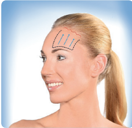
Image of modified and limited brow lift technique: horizontal incision at hairline, area of subcutaneous skin dissection, skin elevation with buried absorbable fixation sutures.

also facilitates a better monitoring of results. This technique allows me to discern and reproduce the patient's facial expression very well during surgery, unlike with general anaesthesia. Nerve damage is also more easily avoided than with the conventional method.